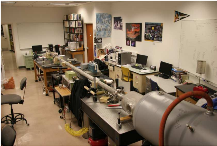
Carlsen Analysis Center.

desk in the room. Depending on the time of year, the Analysis Center may be the center of activity for a senior research project or two. Student research projects are conducted under the mentorship of one of the physics faculty members.